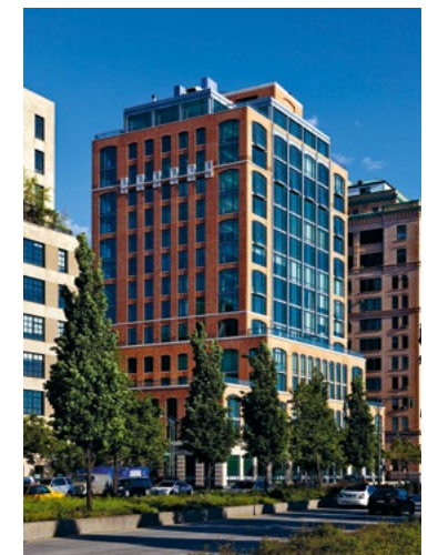
Superior Ink New York (Developer: Related)