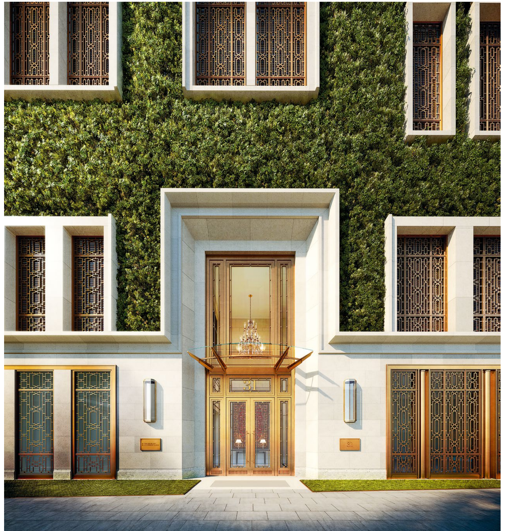
The grand front façade and entrance of The Morgan

Robert A.M. Stern Architects has achieved this transformation through the skilled use of the finest materials and a subtle layering of details. Limestone anchors the building in its environment. The craftsmanship of the bronze screen at the entrance ties the tower into local traditions. The open-air balconies and terraced set-backs give the building a singularly sculpted profile, responding to the Peak above and the city skyline below.