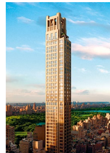
520 Park Avenue New York (Developer: Zeckendorf Development)