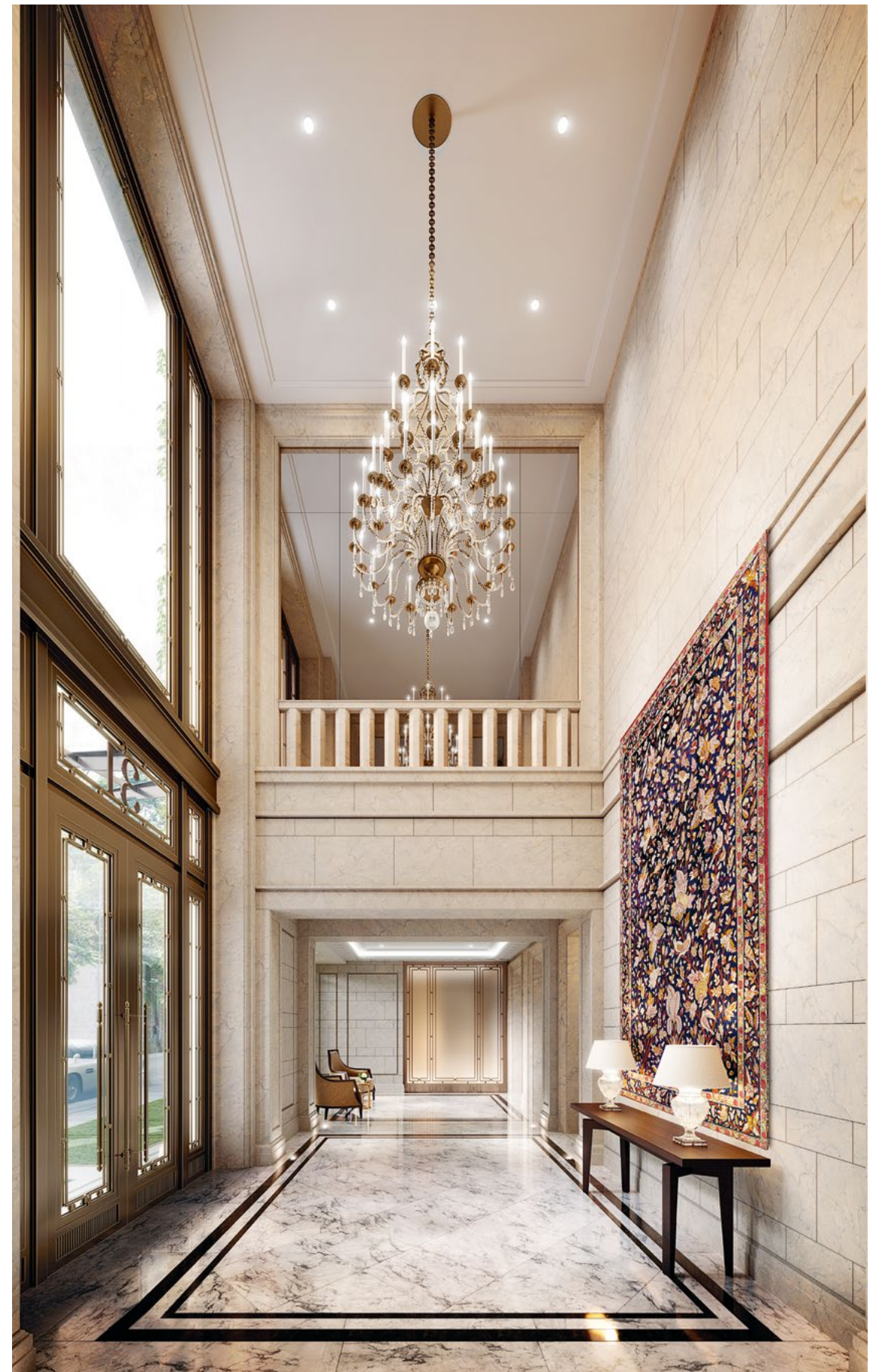
The lobby of The Morgan

The team at Robert A. M. Stern Architects has focused on Hong Kong's extraordinary natural landscape, creating a building with a sense of permanence on the outside, whilst allowing for the possibility of choice and change within. And these are the rich and rare ingredients that make The Morgan such a striking, attractive proposition in Hong Kong.