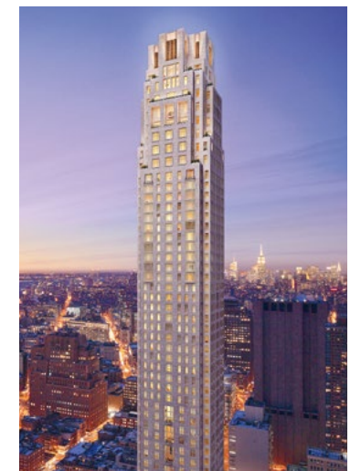
30 Park Place New York (Developer: Silverstein Properties)