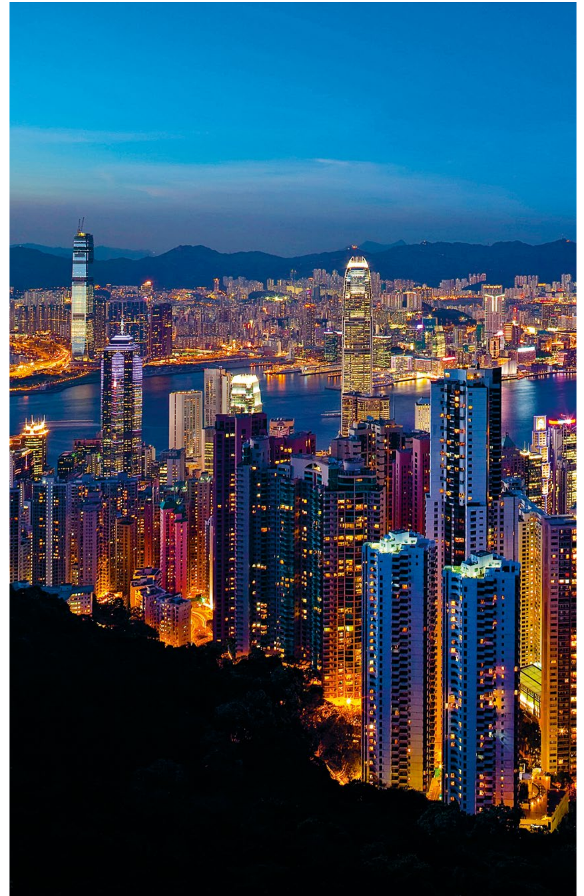
The evening skyline of Hong Kong Island overlooking Victoria Harbour and Kowloon

Against this complex backdrop Robert A.M. Stern Architects' design for The Morgan is a striking achievement. Like Hong Kong it pays homage to the past, but its heart is in the future.