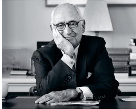
Robert A.M. Stern, Founder and Senior Partner, Dean of the Yale School of Architecture

The offices of the 300-person firm that Robert A.M. Stern founded in 1969 are full of models constructed in paper and moulding clay at all scales from townscapes to full-size details. Despite the fact that the New York-based practice is well versed in the latest computer and software skills essential to the practice of architecture in the 21st century, the firm remains committed to the importance of the human hand and human eye in the design process.