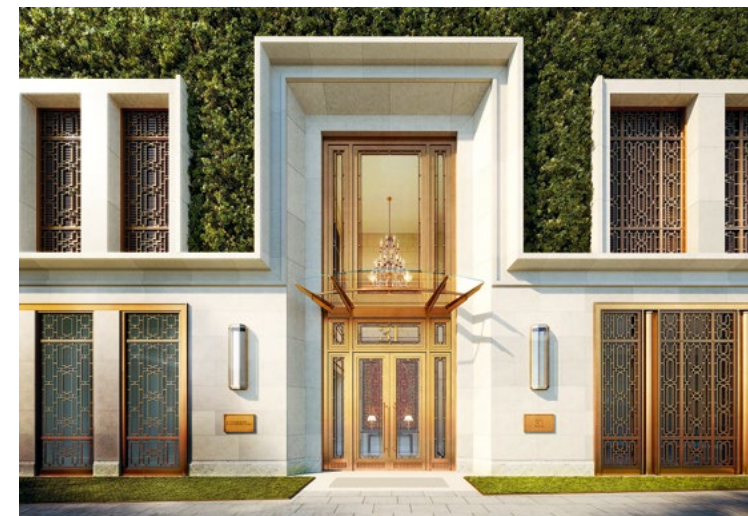
The Morgan, 31 Conduit Road Hong Kong (Developer: Phoenix Property Investors)

As these famous Robert A. M. Stern Architects' properties have done in New York and Toronto, The Morgan will become the new luxury residential standard in Hong Kong, a tangible statement of refined character and the city's most sought-after elegant home for its more discerning citizens.