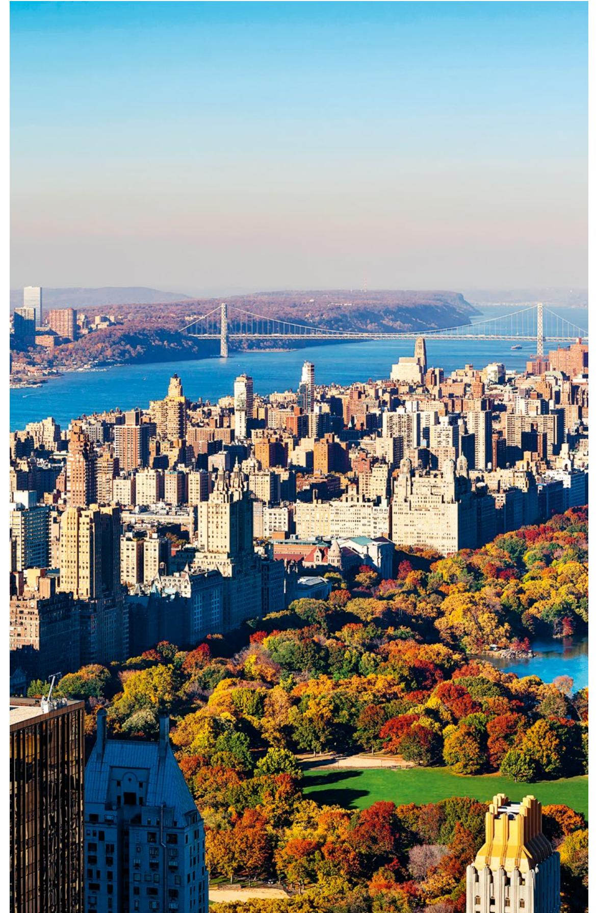
The residential buildings of Upper East Side, New York, looking across Central Park to the Hudson River