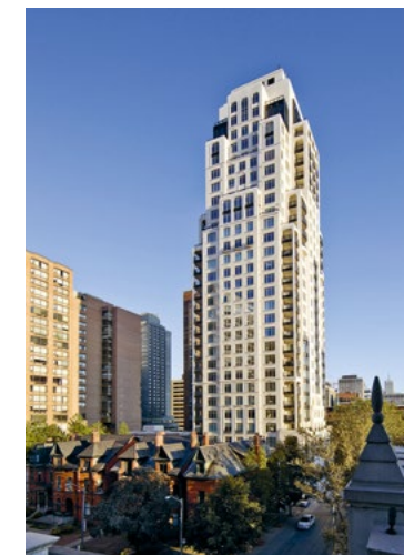
One St. Thomas Residences Toronto (Developer: Lee Development Group)