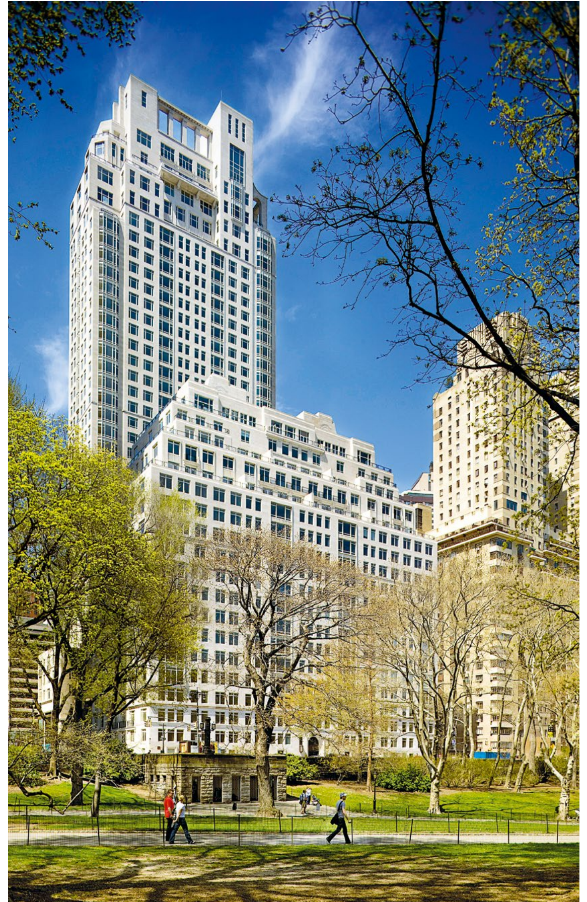
Fifteen Central Park West, New York, New York (Developer: Zeckendorf Development)

Through the 1970s the firm focused on apartment renovations and single-family houses, which even today remain at the heart of the firm's practice. The apartments taught Stern and his colleagues important lessons about how people live in cities; the houses, which ranged from New England to