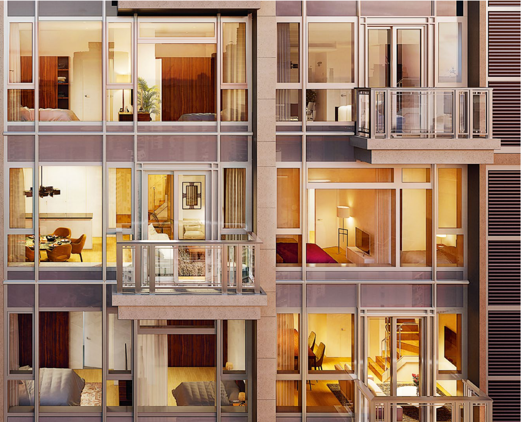
The Morgan's staggered duplexes and their balconies on Conduit Road

"The best apartment blocks have a wide variety of apartment types," Stern explains. In speaking of The Morgan, he adds, "the duplex is wonderful, like a traditional house, and it gives us a richer scale reading on the façade."