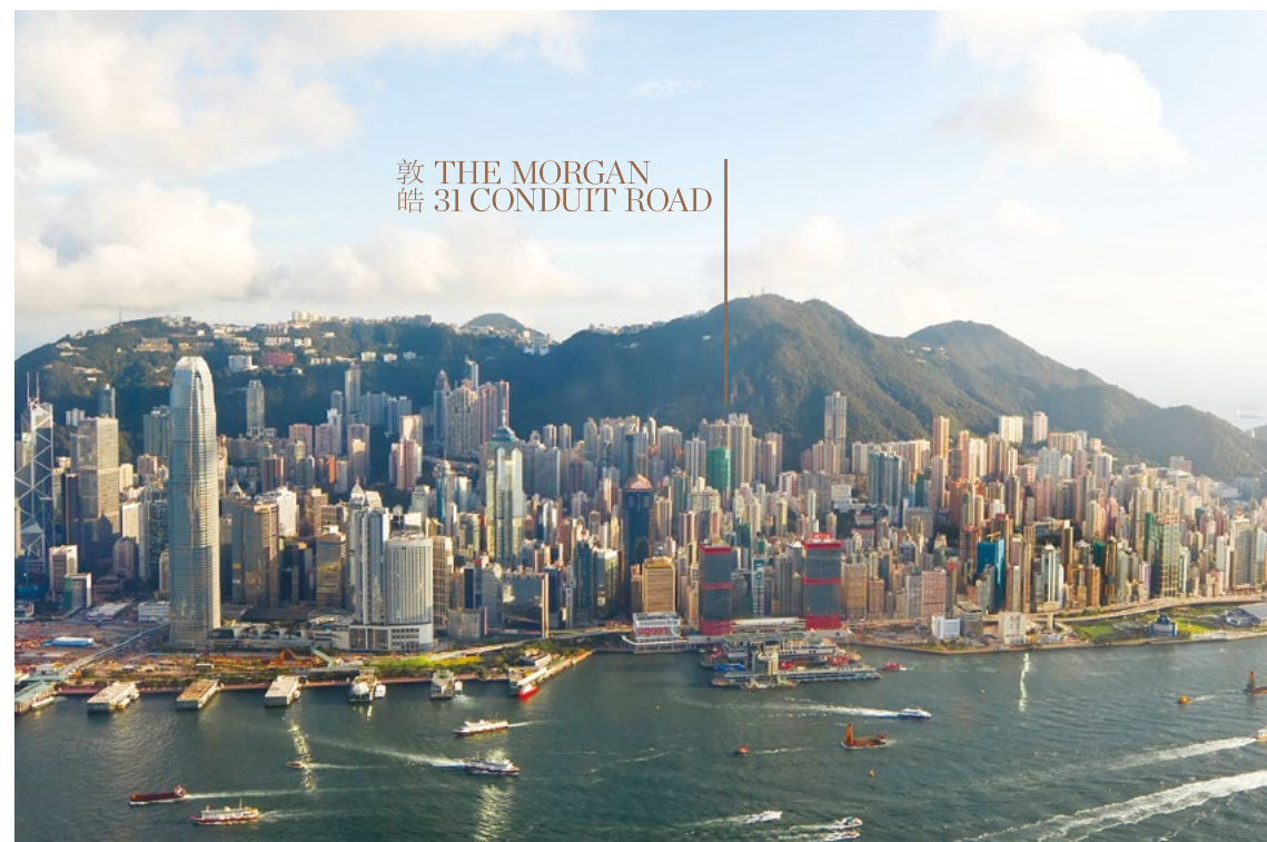
Victoria Peak from Hong Kong Harbour